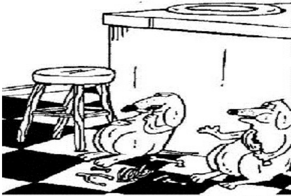
What it really comes down to is a question of values... is a delicious, succulent turkey, baked to perfection, worth a few whacks on the nose with a newspaper?